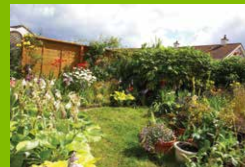
Best Garden winner - David Stower from Seaview Grove, Laytown.